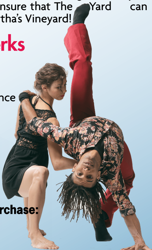
MALPASO DANCE COMPANY

Admission to a behind the scenes rehearsal with the company