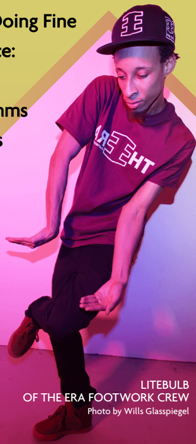
LITEBULB OF THE ERA FOOTWORK CREW

August 28 | Subject:Matter: Beginner Tap