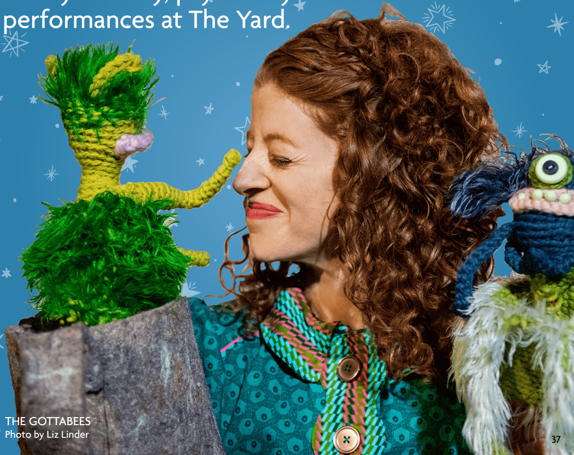
THE GOTTABEES

Family friendly, pay what you can matinee performances at The Yard.